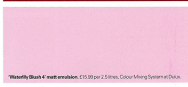
'Waterlily Blush 4' matt emulsion, £15.99 per 2.5 litres, Colour Mixing System at Dulux.