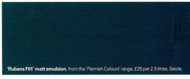
'Rubens F01' matt emulsion, from the 'Flemish Colours' range, £25 per 2.5 litres, Sealed.