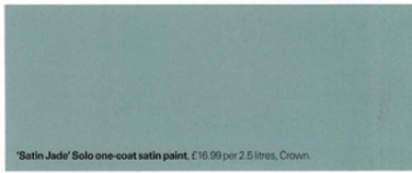
'Satin Jade' Solo one-coat satin paint, £16.99 per 2.5 litres, Crown.