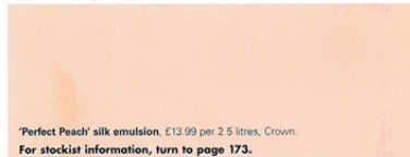
'Perfect Peach' silk emulsion, £13.99 per 2.5 litres, Crown.

For stockist information, turn to page 173.