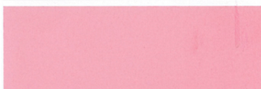
'Havelterberg B06' matt emulsion, from 'The Burden of Choice' range, £26 per 2.5 litres, Sealed.